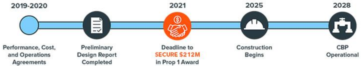
3-1. Simplified CBP Schedule

IEUA and agency partners continue to work together to define program elements on a schedule consistent with the proposed commitments to achieve local and statewide public benefits (see Figure 3-1 and Table 3-1). As described above, the anticipated date for commencing CBP operation is 2028. Additional details of the schedule and progress are provided in Attachments 1 and 2, respectively.