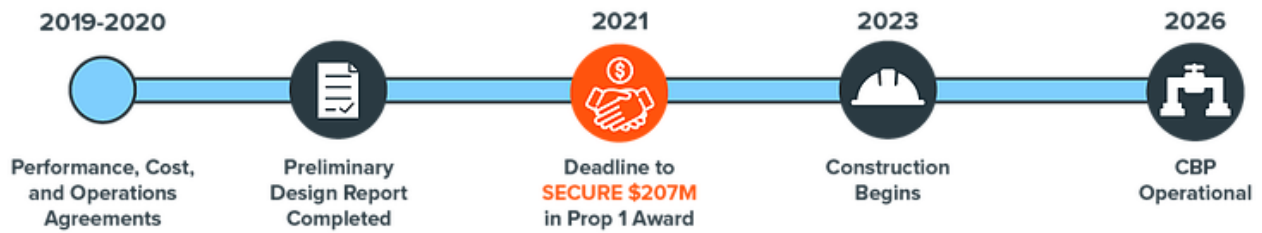
Figure 3-1. Simplified CBP Schedule

CBP milestones leading up to the Commission’s WSIP conditional funding award date are shown on Table 3-1 .