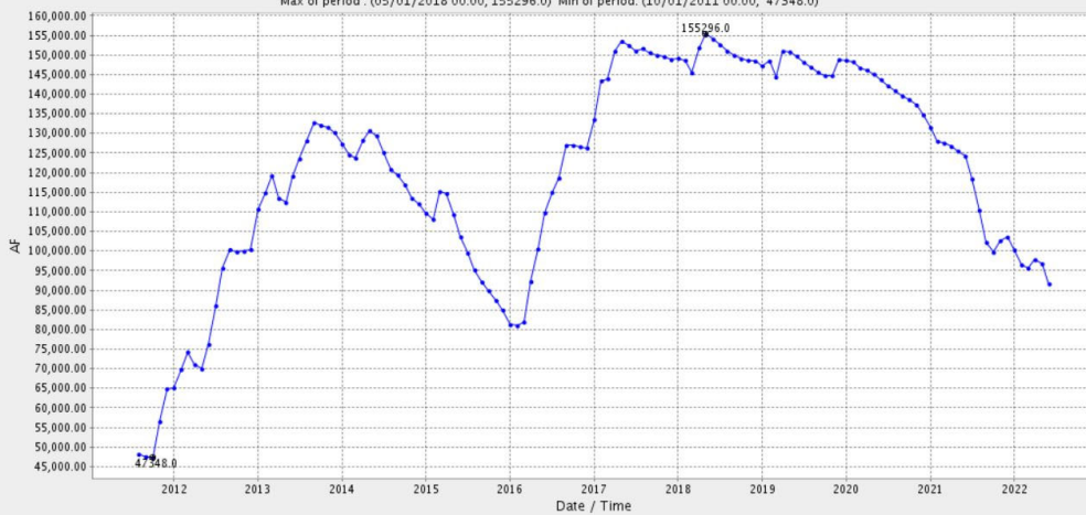
→ RESERVOIR STORAGE - AF (9052)

Date from 07/19/2011 00:00 through 07/01/2022 00:00 Duration : 133 Months Max of period : (05/01/2018 00:00, 155296.0) Min of period : (10/01/2011 00:00, 47348.0)