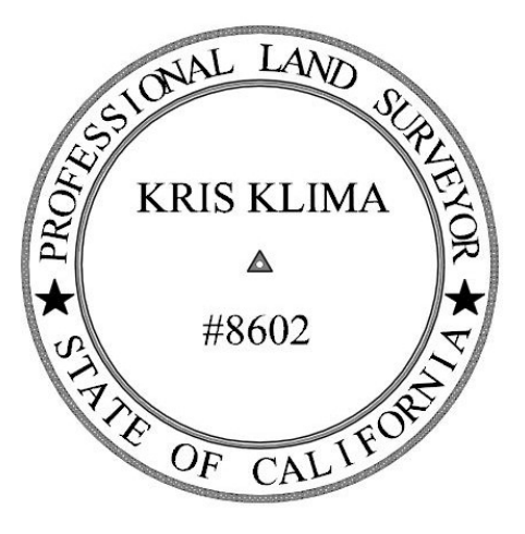
KRISTOPHER KLIMA, PLS