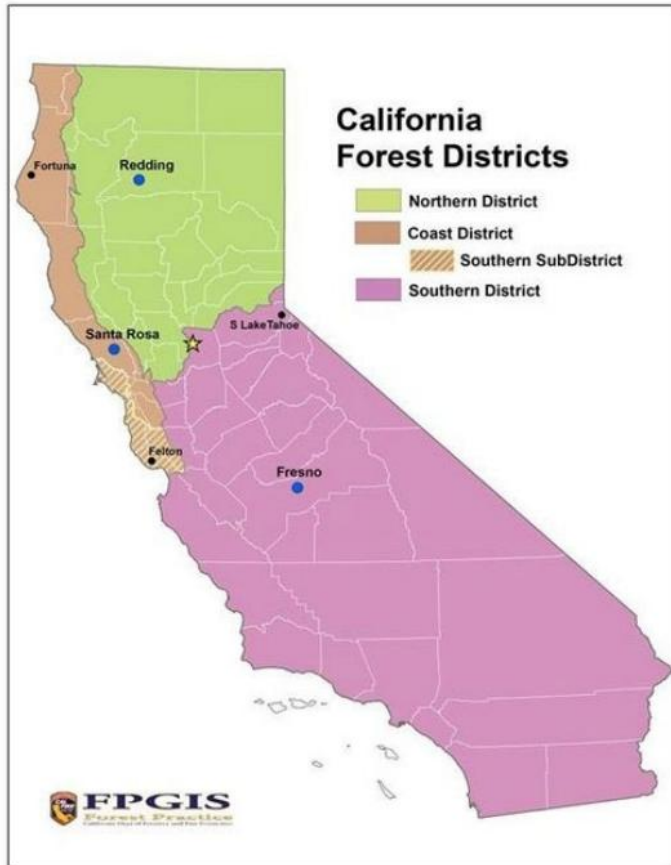
Figure 1 Map of CAL FIRE Forest Practice Districts and Region offices.

Note: The times provided in Table 16 include delays that are beyond the review team’s control, such as those due to weather (e.g. snow prohibits access), delays in RPF response to questions from the review team, delays due to public comment, staff responding to emergency incidents, and delays due to sensitive species evaluations, etc. Individual Plan outliers greater than one year in review have been removed to represent more accurate time frames. Substantial Deviations are not included.