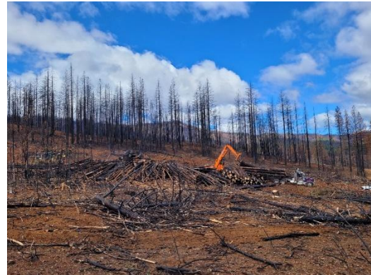
Figure 2 The Dixie Fire ignited on July 13, 2021. Photo of post fire salvage logging.

In certain situations, Notices of Emergency (Emergencies) and Notices of Exemption from Timber Harvesting Plan Requirements (Exemptions) allow landowners to utilize a ministerial harvest document to harvest timber rather than preparing a discretionary document such as a THP, NTMP, MTHP, or WFMP. Ministerial documents receive a rapid administrative review only for accuracy of the submittal prior to acceptance or return. Emergencies and Exemptions require compliance with the Forest Practice Rules and other agency regulations governing timber harvest, road construction, residual timber stocking standards, and protections for fish and wildlife species, and water quality. Emergency notices allow landowners to capture loss to their timberlands from fire, wind, insects or disease, whereas Exemption notices are “pre-mitigated” harvest documents that have strict parameters on use that must be adhered to when operating. Unlike THP’s, NTMP’s or WFMP’s, Emergency notices and exemptions cannot have alternative methods proposed as no discretionary review is performed to analyze alternative proposals.