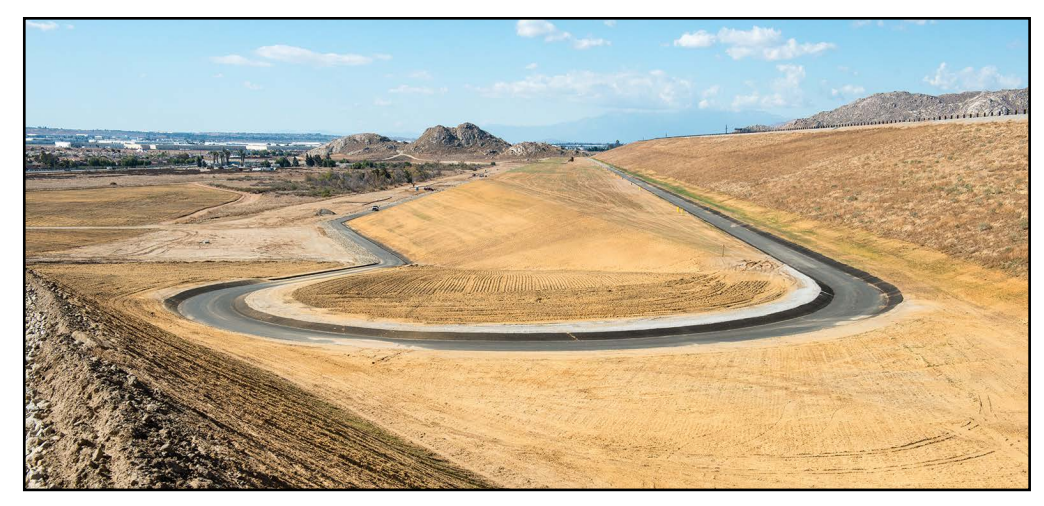
The seismic remediation of the dam embankment has been completed at Lake Perris in Perris, California. Perris is located in Riverside County. Photo taken February 23, 2018.

Outlet Tower Improvements: Analyses of the Perris Outlet Tower have indicated the tower can survive the Maximum Credible Earthquake. This project is now focusing on a seismic retrofit of the tower's bridge, retrofits to and replacement of critical operating equipment, modification to the outlet structure to receive a redundant roller gate and refurbish the existing slide gate and penstock steel liner. The roller gate will replace a bulkhead that poses an impractical feature to remove in the midst of an emergency drawdown. Design efforts are currently underway, and the Tower Bridge Seismic Retrofit work is anticipated to complete by September of 2020. The remaining retrofit and replacement work are anticipated to be completed by November of 2021.