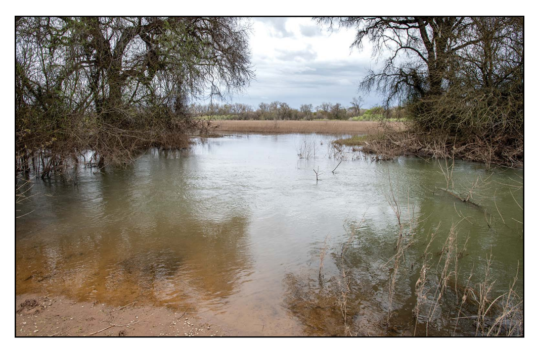
The Oneto-Denier Floodplain Restoration Project in the Cosumnes River Watershed near Galt, in Sacramento County, California. Photo taken March 20, 2019.

Flood-Managed Aquifer Recharge (Flood-MAR): DWR is evaluating the use of high flows and planned reservoir releases for managed aquifer recharge on farmland, working landscapes, and managed natural lands for groundwater replenishment, water supply reliability, flood risk reduction, and ecosystem enhancement. DWR released a Flood-MAR White Paper in 2018 that described the Flood-MAR concept and identified barriers and challenges to implementation. DWR is evaluating Flood-MAR opportunities in the Merced River Basin as a watershed-scale pilot study (published findings expected in Fall 2019) and providing technical assistance to local landowners and water agencies interested in implementing Flood-MAR projects.