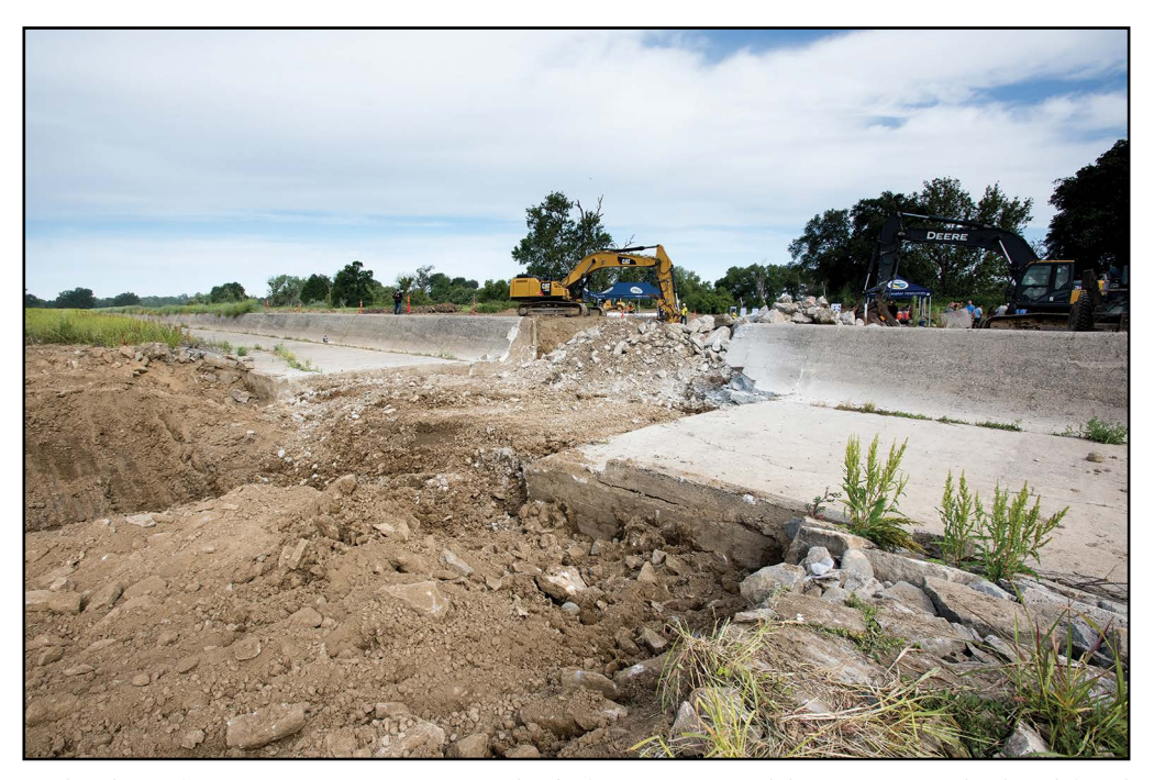
In this photo taken May 30, 2018, an excavator has broken up a section of the Fremont Weir for the Adult Fish Passage Modification Project, to restore an important migration corridor for native fish species and fulfill requirements set forth in the 2009 National Marine Fisheries Service's Biological Opinion. California Department of Water Resources (DWR), U.S. Bureau of Reclamation, California Natural Resources Agency and other federal, state, and local partners celebrate the groundbreaking of the Fremont Weir Adult Fish Passage Modification Project, a critical habitat improvement project in the Yolo Bypass.

In 2008, the U.S. Fish and Wildlife Service issued its Biological Opinion on the Long-term Operation of the CVP and SWP (USFWS Operation BO). The USFWS Operation BO concluded that, if left unchanged, CVP and SWP operations were