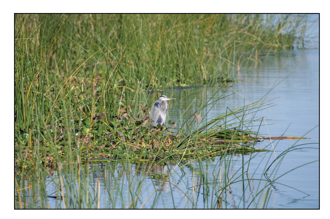
This photo taken December 3, 2018, shows a great blue heron perched in a marsh near the Dutch Slough Tidal Marsh Restoration Project, in the Sacramento-San Joaquin Delta near Oakley, California. The restoration project implemented by the California Department of Water Resources will restore 1,187 acres into a tidal marsh to provide habitat for salmon and other native fish and wildlife.

Decker Island: Construction on this tidal restoration project started and was completed in 2018. Approximately 110 acres of credit are expected for this project. See the link to DWR's website for video and more details: https://water.ca.gov/ News/Blog/2018/Nov-18/Decker-Island-Project.