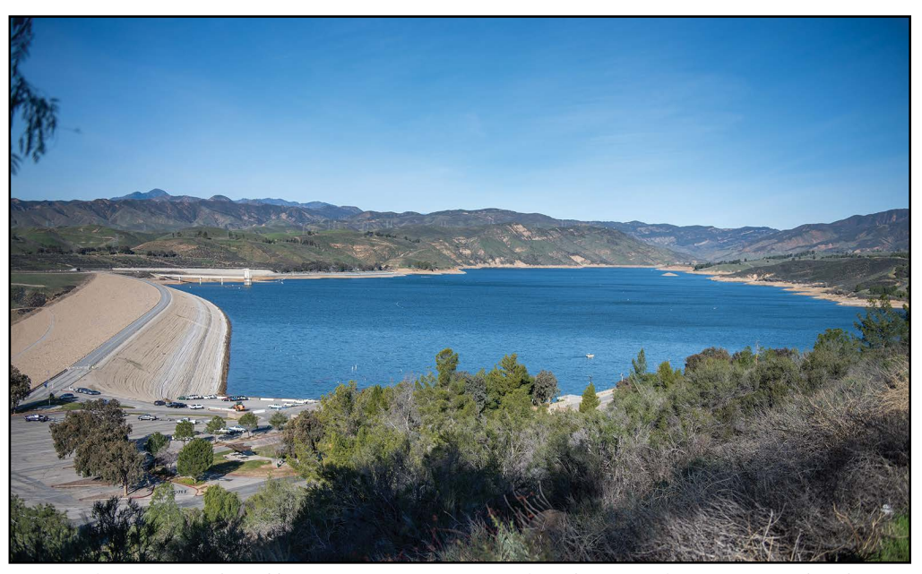
Castaic Lake is a reservoir formed by Castaic Dam on Castaic Creek, in the Sierra Pelona Mountains of northwestern Los Angeles County, California. In 2018, DWR completed spillway inspections, assessments and maintenance efforts on seven SWP dams: Pyramid, Castaic, Cedar Springs, Grizzly Valley, Frenchman, Antelope, and Del Valle.

"Asset management" describes the coordinated activities of an organization to realize value from its assets. Since much of the SWP's infrastructure exceeds 50 years of age, the maintenance needs of the system have increased to require more frequent refurbishment, renewal, and replacement. DWR has adopted asset management as an approach to decision making, using all available information