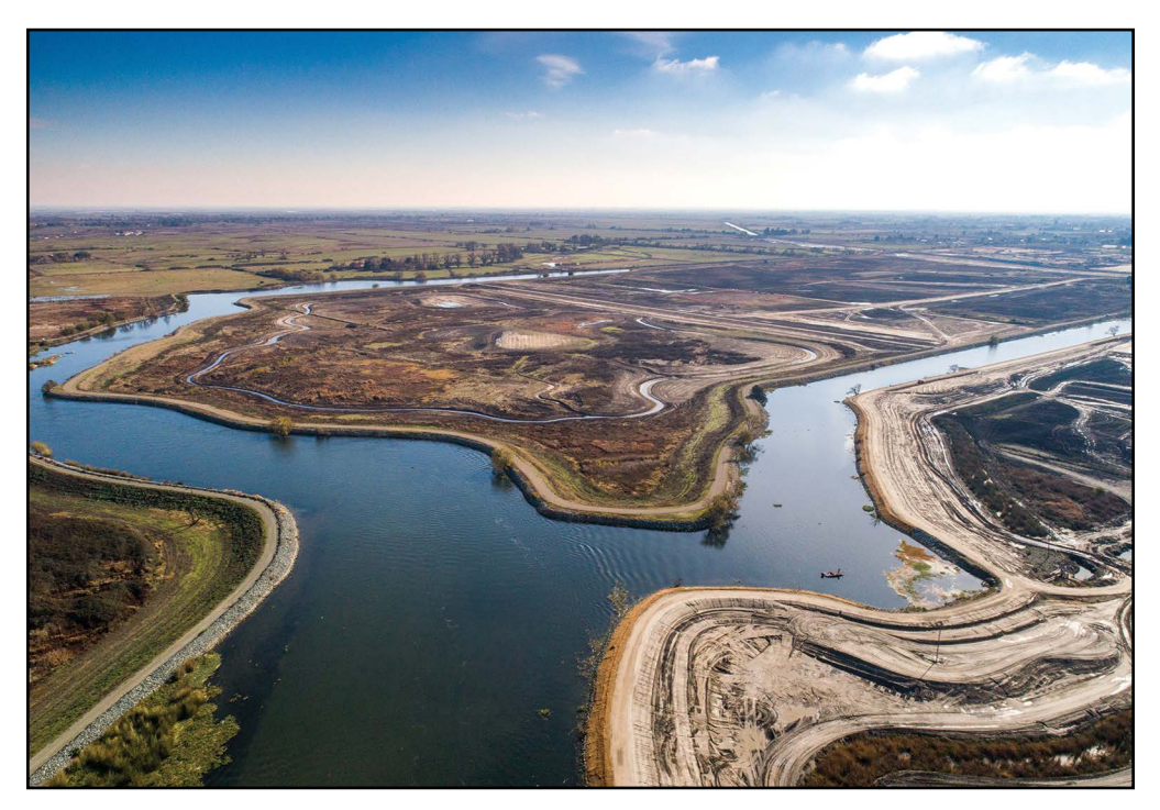
In this photo taken on December 3, 2018, a drone provides a bird's-eye view of the Dutch Slough Tidal Marsh Restoration Project construction site, in the Sacramento-San Joaquin Delta near Oakley, California. The restoration project implemented by the California Department of Water Resources will restore 1,187 acres into a tidal marsh to provide habitat for salmon and other native fish and wildlife.

To implement this important oversight responsibility, DWR created the Delta Conveyance Office (DCO) in the spring of 2018. The DCO will ensure that the project meets DWR standards for safety, durability, and long-term operations and maintenance. Additional DCO responsibilities include ensuring compliance with the JEPA agreement between DWR and the DCA, and reviewing and approving the California WaterFix annual budget.