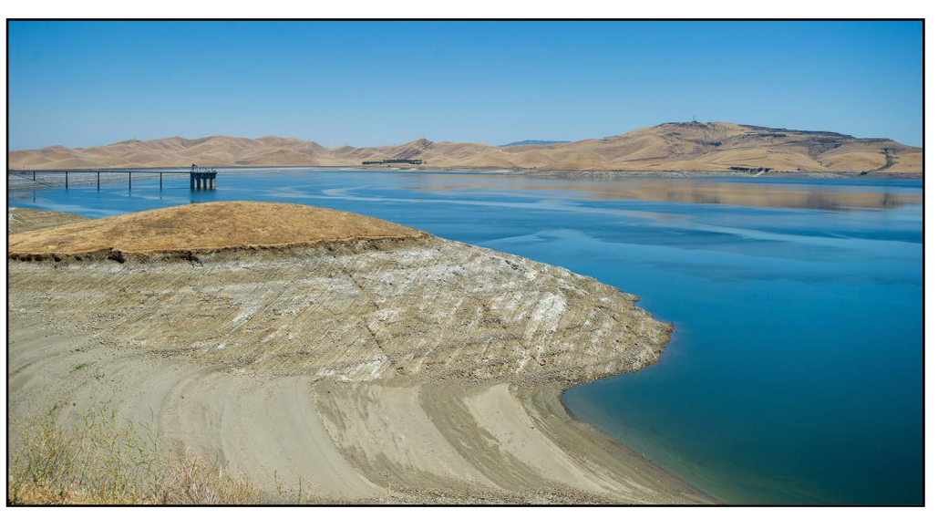
San Luis Reservoir, located 12 miles west of the city of Los Banos near the historic Pacheco Pass, is part of the San Luis Joint-Use Complex, which serves the State Water Project and the federal Central Valley Project. San Luis Reservoir is one of the nation's largest off stream reservoirs, meaning it has no watershed. Instead the reservoir stores water diverted from the Sacramento-San Joaquin Delta for later deliveries to the Silicon Valley, San Joaquin Valley, the Central Coast, and Southern California. Photo taken July 11, 2018.

DWR's emissions vary greatly from year to year because SWP operations depend on hydrology, and increasing water deliveries increases emissions. Even with these variations, DWR is currently on track to meet its 2020 and 2050 emissions reduction targets. However, DWR's long-term emissions reduction targets will need to be revised in accordance with SB 100 which requires 100 percent emissions-free electricity by 2045. DWR monitored the increase in emissions due to the Oroville spillways recovery effort, and does not expect that activity to change the overall trajectory of emissions reduction.